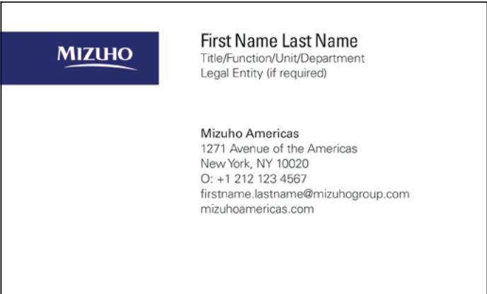
Limited to office phone number only and no entity disclaimers