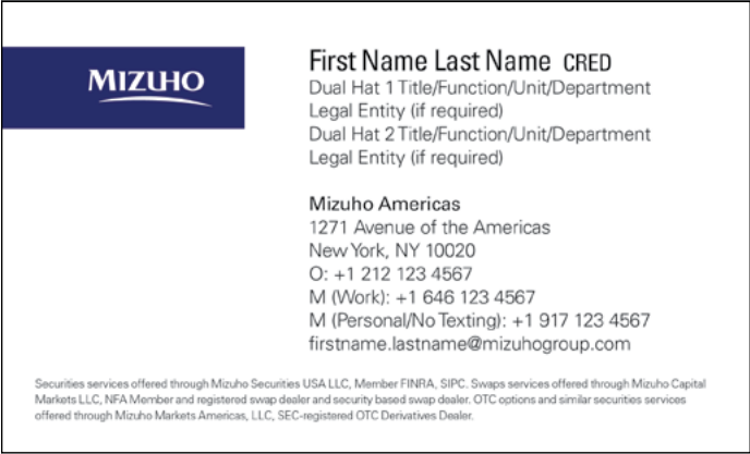
Include both personal and Global Relay mobile numbers with disclaimer