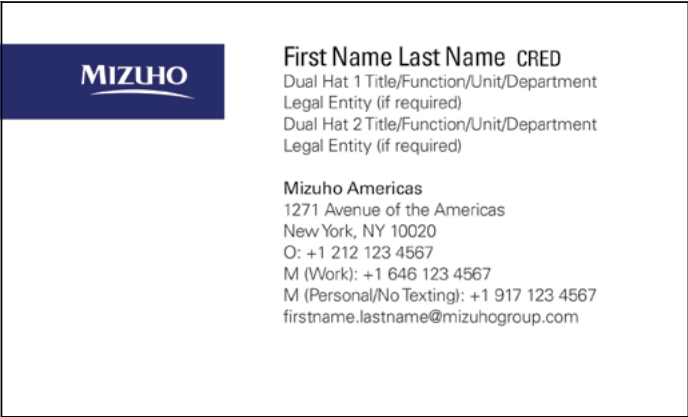
Include both personal and Global Relay mobile number, without disclaimer