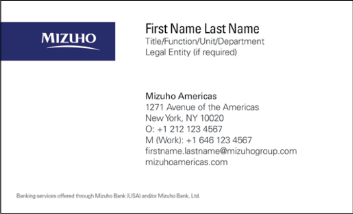
Include Global Relay mobile number, with disclaimer