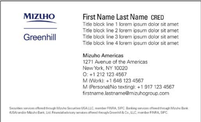
Mizuho | Greenhill (US) Entity: Mizuho Americas