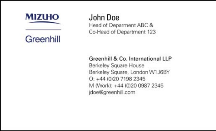
Mizuho | Greenhill (UK) Entity: Greenhill & Co. International LLP