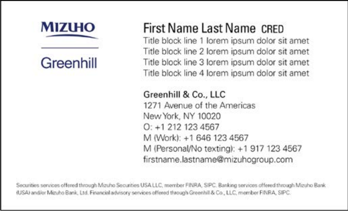
Mizuho | Greenhill (US) Entity: Greenhill & Co., LLC